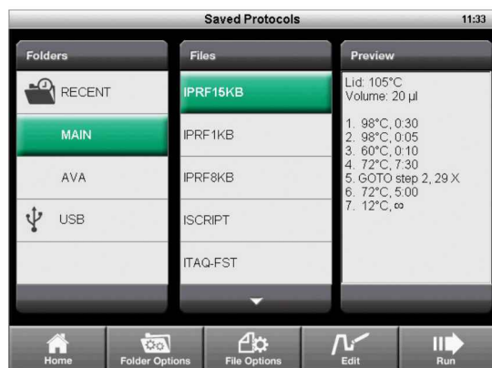
Saved Protocols screen showing the preinstalled library of standard protocols in the MAIN folder.

Intuitive graphical programming. The thermal cycler's onboard software displays an editable thermal profile of the PCR protocol, making it easy to create and run new protocols.