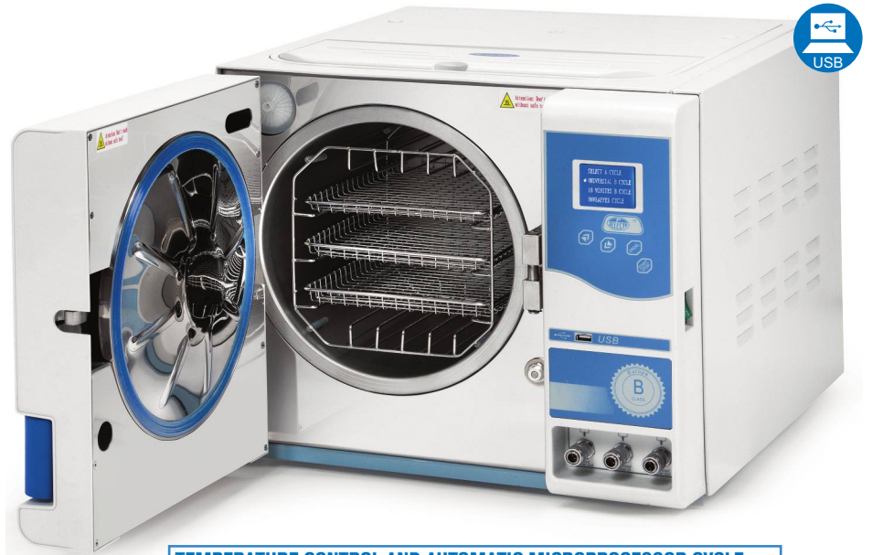
TEMPERATURE CONTROL AND AUTOMATIC MICROPROCESSOR CYCLE.