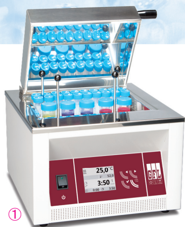
Delivery without pictured accessories