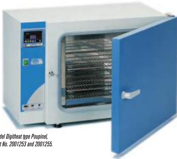
Model Digitheat type Poupinel, Part No. 2001253 and 2001255.