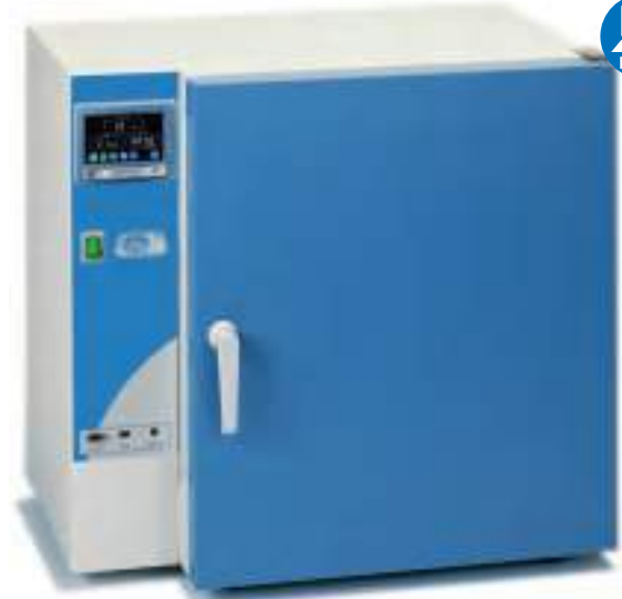
Model Digitheat, Part No. 2001251, 2001252 and 2001254.