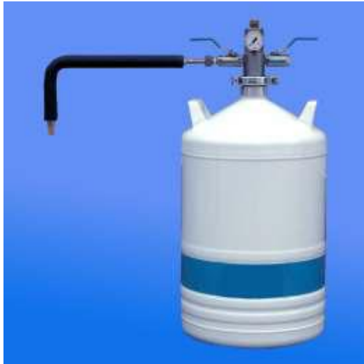
ALU 26 with