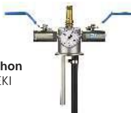
LN2-siphon Type EKI