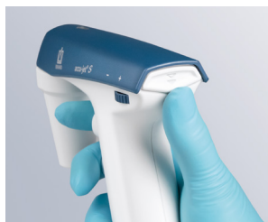
Efficient single-handed operation