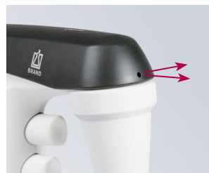
Direct outlet of sample vapors