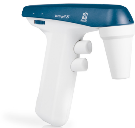
accu-jet® S, color: petrol

Precise pipetting of large and small volumes is simple due to single-handed control of pipetting speed for fast, powerful aspiration, accurate meniscus setting, or precise dispensing of small volumes. Thanks to the precise control, you always achieve the required volume spot-on when working with graduated or bulb pipettes. If you need extra power or precision, motor speed is controlled on the fly with one hand. Choose between gravity-delivery (for pipettes calibrated "to deliver") or powered blow-out delivery (for pipettes calibrated "to contain").