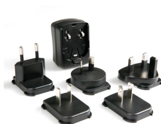
Universal AC adapter Adapter for Europe, UK, USA, Japan, Australia, New Zealand