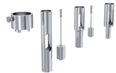
Adapter: O DIN S-1