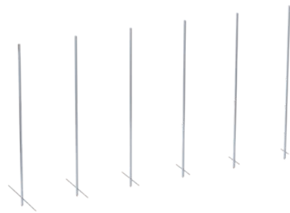
T-SP-6 – T-SP-1