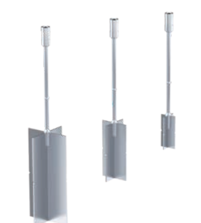
Spindle set: VAN-1