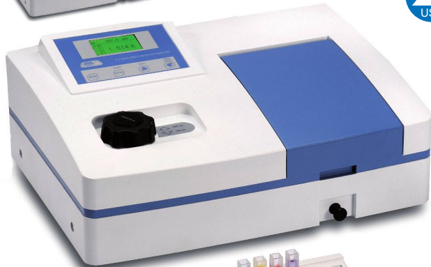
"V-1100" Part no. 4120025