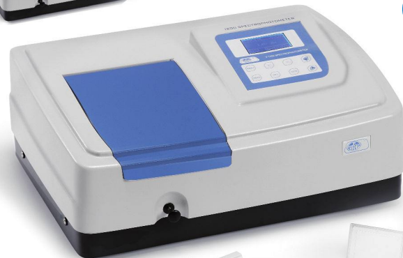
"VR-2000" Part no. 4120026